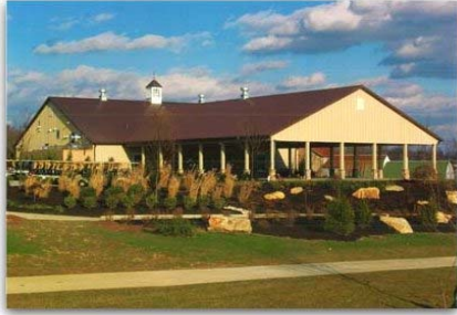
2010 Building of the Year Winner Category: Commercial - 5,000 to 10,000 square feet Applecross Club House Downington, PA Built by Kistler Buildings

NFBA members, you still have time to enter your favorite post-frame building in the distinguished 2011 Building of the Year contest! Download entry form.