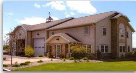
2010 Building of the Year Winner Category: Institutional Volunteer Ambulance Corps Cazenovia, NY Built by Fingerlakes Construction