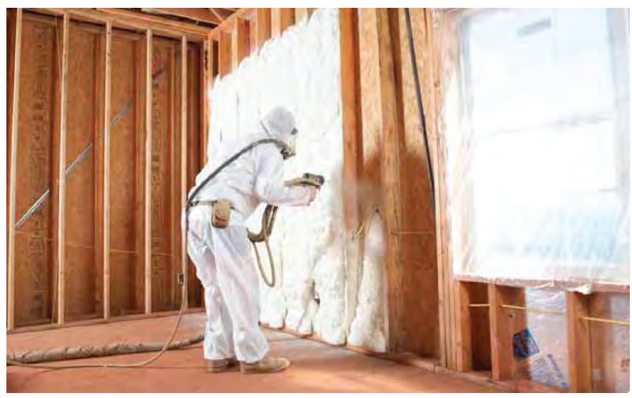
FIGURE 2 . A typical spray polyurethane foam insulation application. The worker applying SPF needs complete personal protective equipment, including an air respirator, eye protection, chemical-resistant clothing and chemical-resistant gloves.

IBC Section 2603 and IRC Section R316 specifically address SPF while focusing on aspects of fire protection. Code compliance for SPF insulation must address three main areas: fire protection, moisture control and building energy use. Following the manufacturer's recommendations for a given SFP product is a critical first step for code compliance. A thermal barrier, such as half-inch gypsum wallboard, is required between the SPF insulation and an occupied space. For open-cell SPF, a vapor barrier will be required according to the same criteria used for fiberglass or cellulose insulation. If open-cell SPF is not protected with a vapor barrier, moisture problems occur that are similar to those occurring when a vapor barrier is not used with fiberglass or cellulose insulation. It is well recognized that SPF insulation can be used to help meet various energy efficiency codes and requirements. When properly installed at adequate minimum thicknesses, SPF insulation can provide both thermal resistance and air barrier capabilities to a building envelope assembly. A final check with local code authorities will help ensure that the proposed materials and application methods will be approved. Following manufacturer's recommendations is typically a part of code compliance.