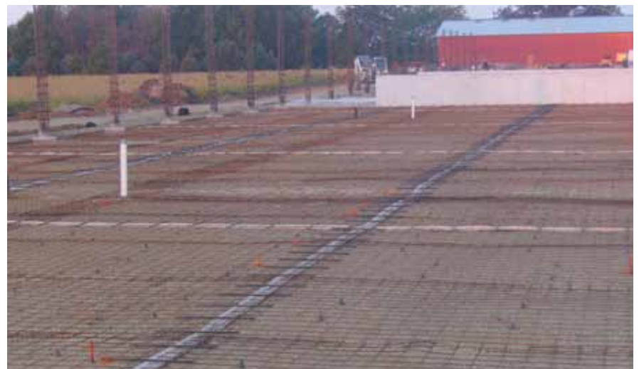
Figure 3. Reinforced slab preparation with waterstops at control joints

Curing slabs properly is just as important as curing other concrete members, but in many ways it is more important because slabs are generally thinner members. Use of curing compound or coverings such as polyethylene sheeting, burlap or sprinklers is critical, especially for the first several days. As concrete cures, the energy released is tremendous, and much of this energy results in the evaporation of water from the concrete surface, water that is needed for proper hydration and hence curing of the concrete. The rate of concrete curing varies greatly with the temperature. Concrete continues to cure for several months and even longer if it has to cure during cold weather. It's interesting to note that when this moisture is released into a poorly ventilated space, it has the potential to create condensation problems for customers and contractors alike. Remember that condensation is a symptom of a larger problem that will need to be addressed.