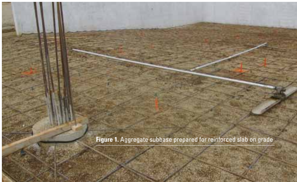
Figure 1. Aggregate subbase prepared for reinforced slab on grade

A layer of aggregate subbase will also help provide a more uniform base for the slab when it is placed across the entire subgrade, providing more uniform support and helping to minimize thickness variation in the slab. Good subgrade drainage is also important to reduce risk of frost heave on exterior slabs as well as swelling and shrinking. Areas of fill should be avoided or limited as much as possible.