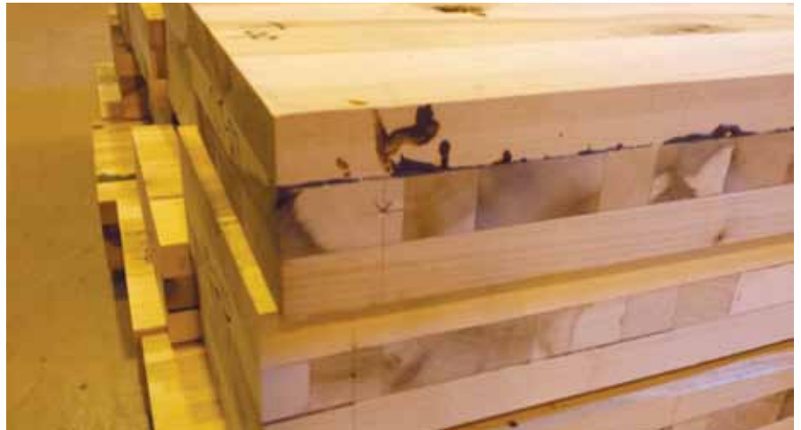
Figure 1. Cross-laminated timber panels

Currently, CLT manufacture and construction in the United States is in its infancy. Several manufacturing facilities are being planned or are in development in this country, but currently CLTs used must be imported from Canada or Europe. Current U.S. CLT construction includes a church bell tower in North Carolina, a school in West Virginia (LignaTerra, 2014), a proposed eight-story building in Minneapolis (Construction Dive, 2015) and many