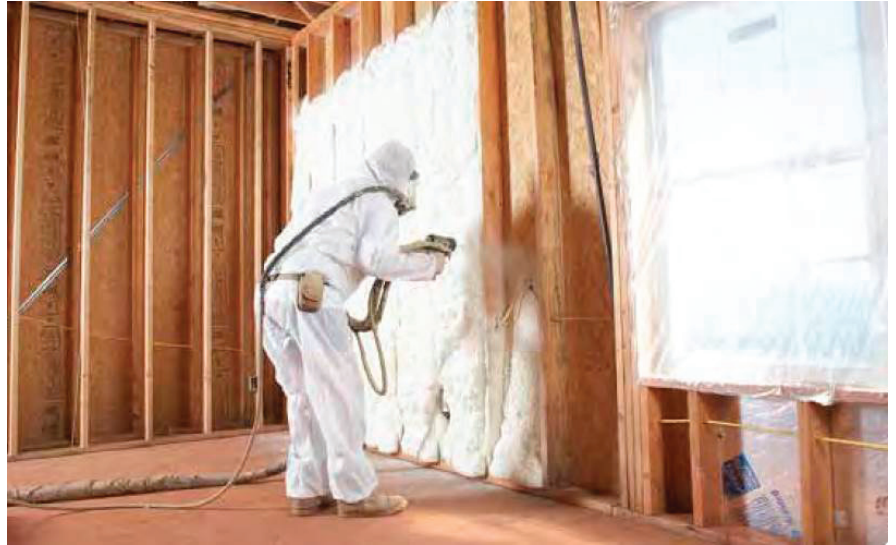
FIGURE 2. A typical spray polyurethane foam insulation application. The worker applying SPF needs complete personal protective equipment, including an air respirator, eye protection, chemical-resistant clothing and chemical-resistant gloves.

IBC Section 2603 and IRC Section R316 specifically address SPF while focusing on aspects of fire protection. Code compliance for SPF insulation must address three main areas: fire protection, moisture control and building energy use. Following the manufacturer's recommendations for a given SFP product is a critical first step for code compliance. A thermal barrier, such as half-inch gypsum wallboard, is required between the SPF insulation and an occupied space. For open-cell SPF, a vapor barrier will be required according to the same criteria used for fiberglass or cellulose insulation. If open-cell SPF is not protected with a vapor barrier, moisture problems occur that are similar to those occurring when a vapor barrier is not used with fiberglass or cellulose insulation. It is well recognized that SPF insulation can be used to help meet various energy efficiency codes and requirements. When properly installed at adequate minimum thicknesses, SPF insulation can provide both thermal resistance and air barrier capabilities to a building envelope assembly. A final check with local code authorities will help ensure that the proposed materials and application methods will be approved. Following manufacturer's recommendations is typically a part of code compliance.